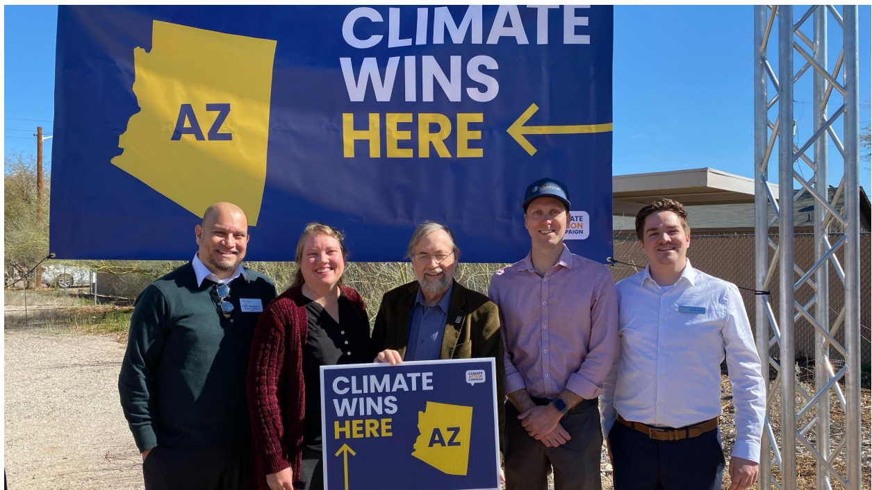
Speakers at Climate Action Campaign Tucson, AZ event